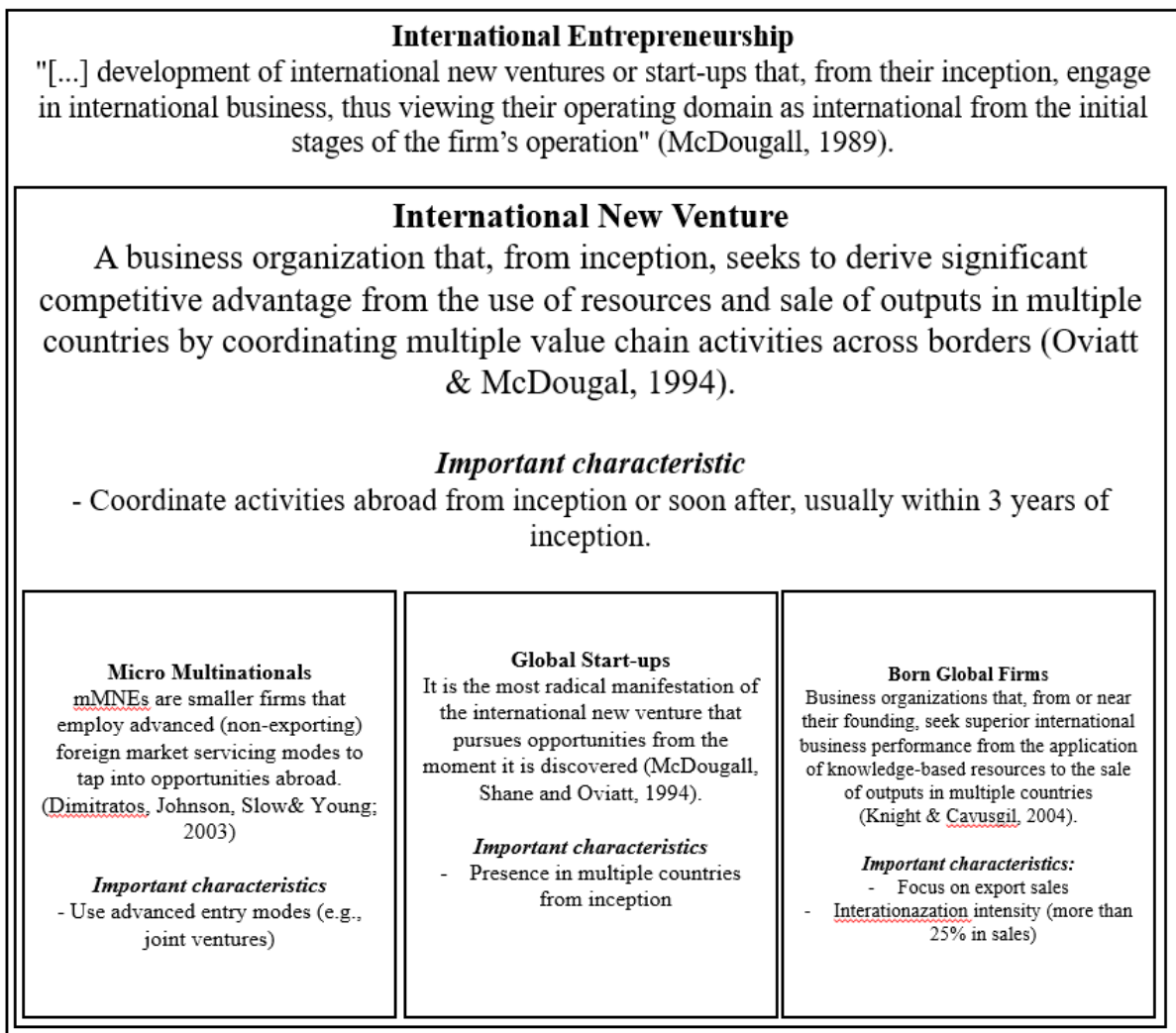
Figure 1 - Conceptual Framework