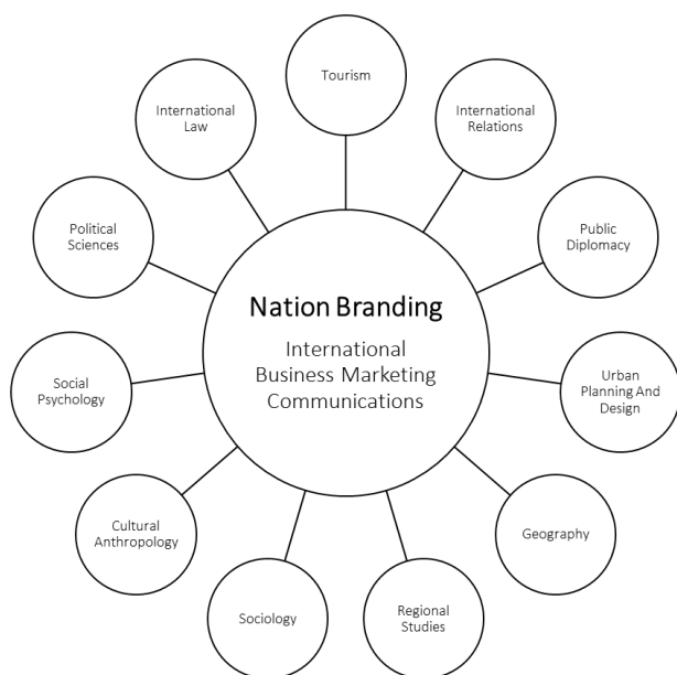
Figure 2: Disciplines related to place (nation) branding

The various disciplines related to place/nation brand and place branding are shown in Figure 2 below.