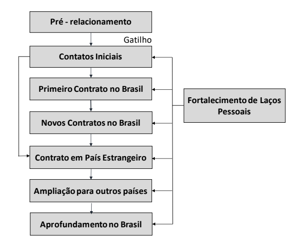
Fig. 7. Generic relationship process between similar-sized firms

When firms are of a similar size – typically smalland medium-sized – stages are more flexible and demarcated over time through the strengthening of